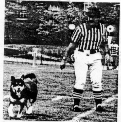
I'll see you after the game.