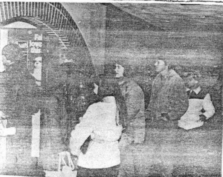
LONG LINES was one of the few events that was able to go on as scheduled last Friday, as the blackout caused cancellation of most planned activities.

When it was pointed out to the students that the seals were made from polyester, the spokesperson said, "Well, the senseless slaughter of young esters just because people will deposit a few dollars is insane."