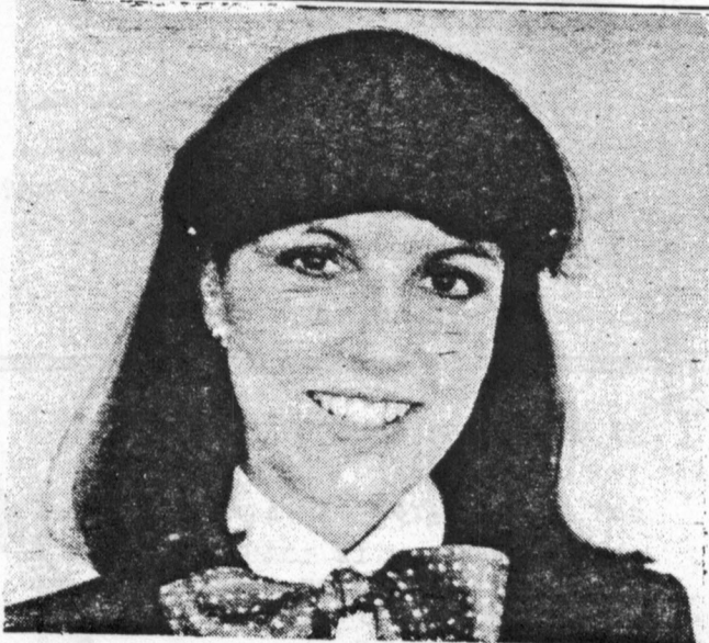
Want A Date?

When confronted with the point that America, under this program, would eventually become a country of senile workers and illiterate unemployed, Reagan stated that in his experience, he has found illiteracy and senility to be definite positive qualities.